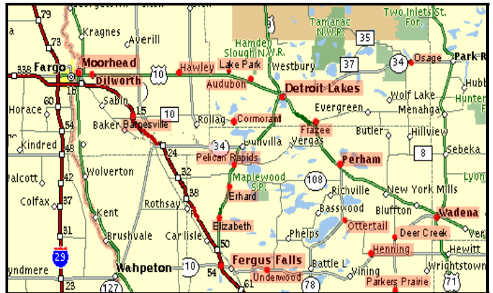
Diagram 1: DISTRICT 3 MAP